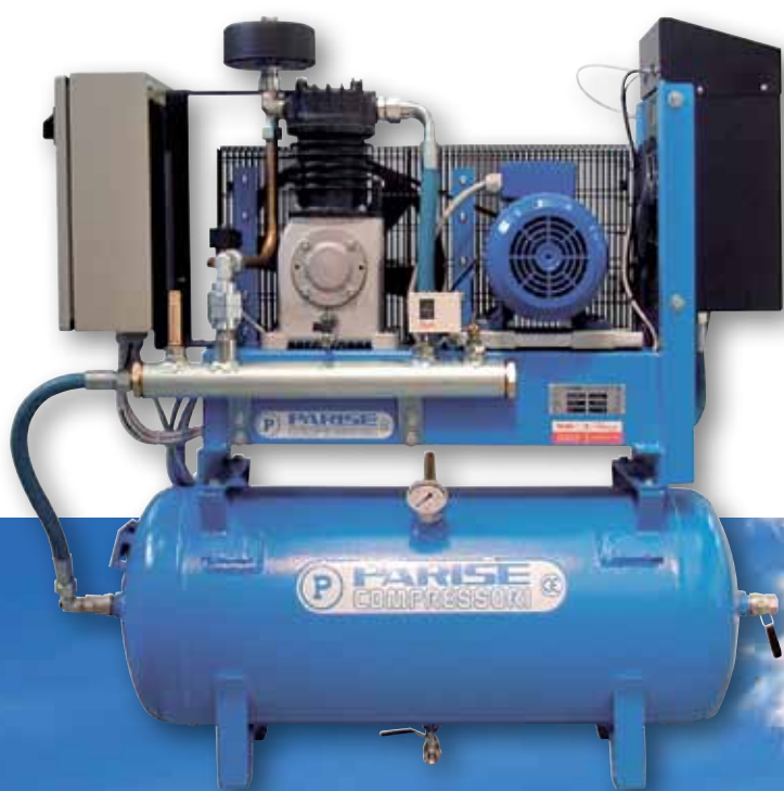
< HIGH, LOW PRESSURE PISTON COMPRESSORS