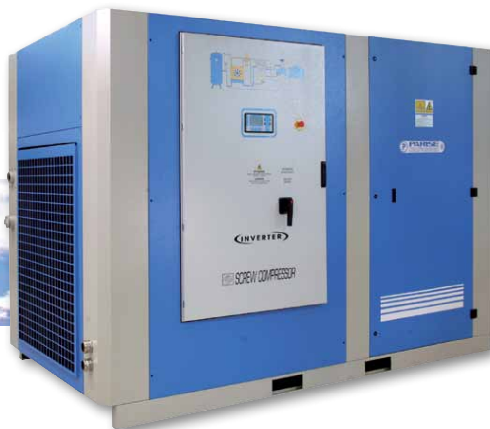
< INVERTER ROTARY SCREW COMPRESSORS