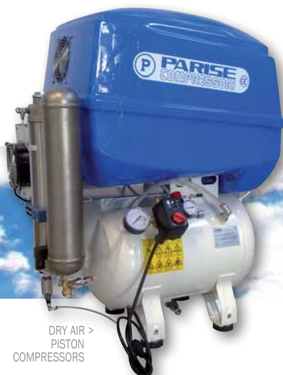
DRY AIR > PISTON COMPRESSORS